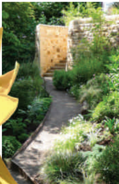
Water Gems winning garden

In the 'Reinforcing Nature' garden by award-winning landscaper Water Gems in association with Secret Gardens, the heart of the garden will be a huge naturalistic pond with walkways and a shelter created out of Rebar, the steel rods used for reinforcing construction projects. You can follow the progress of the Water Gems garden at www.reinforcingnature.org